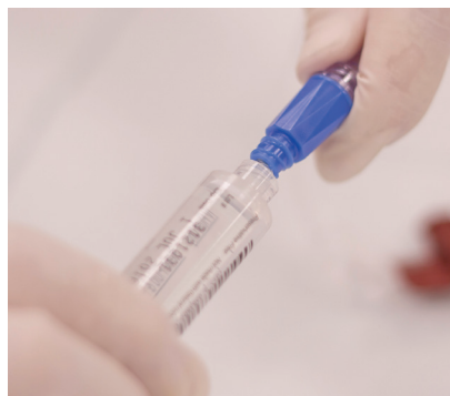
Clamp the line and remove the syringe