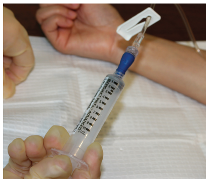
Unclamp the line and flush