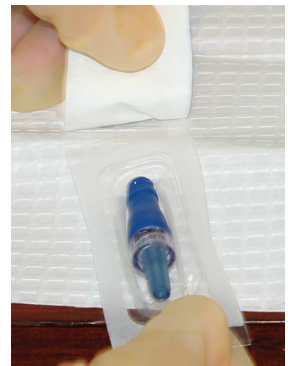
Remove connector from package